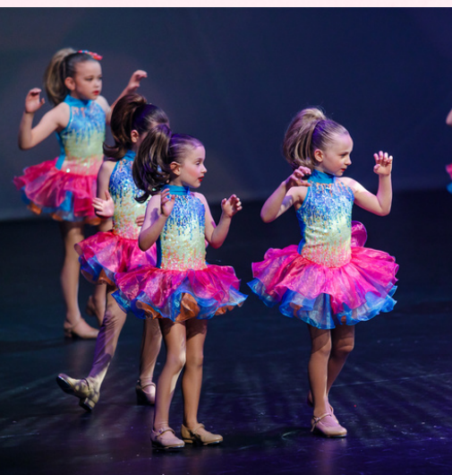
Photo Packages will be available online after the concert. There will be live photos taken throughout the show, as well as studio shots available in the foyer for your dancer to pose for portraits. All photos are digital copies and will be emailed to you once selected and purchased.